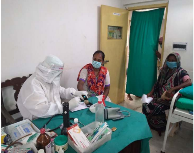
Humanity Hospital Sundarban